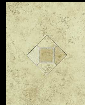
Sand BX02 9" x 12" Wall Accent w/insert