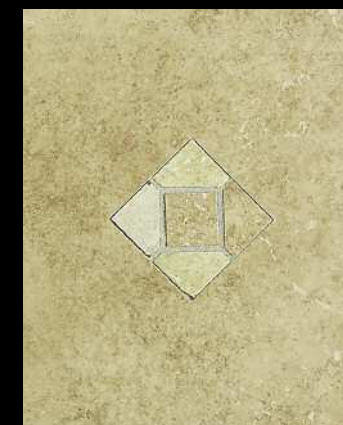
Mushroom BX03 9" x 12" Wall Accent w/insert