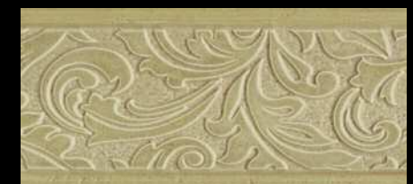
Mushroom BX03 Wall Accent