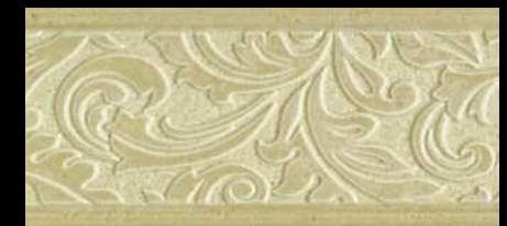
Sand BX02 Wall Accent