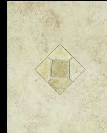
Bone BX01 9" x 12" Wall Accent w/insert