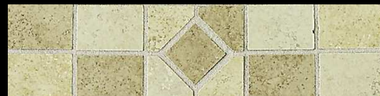
Universal Accent BX10