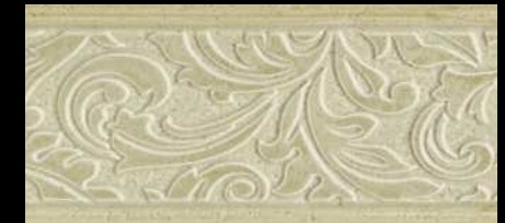
Bone BX01 Wall Accent